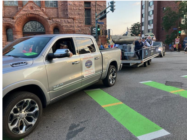
Our parade unit in downtown Minneapolis