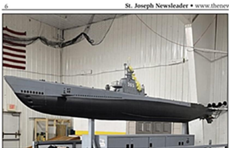
This is the model submarine that will be displayed at the car show Aug. 18 in Sauk Rapids.