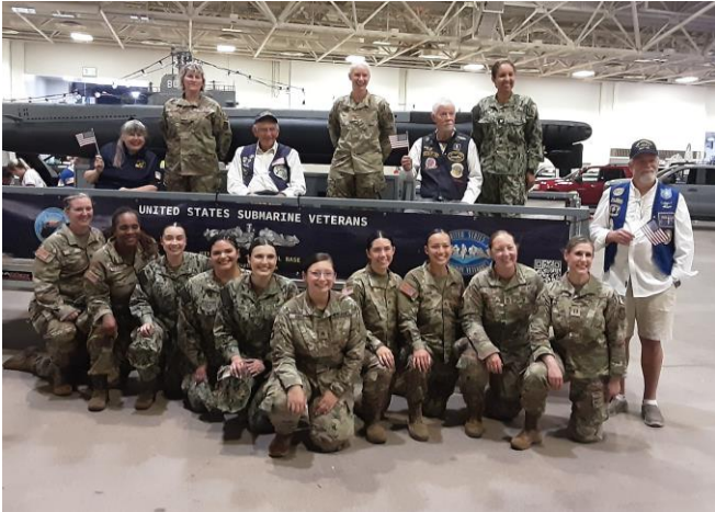
The assembly area beneath the Mpls Convention Center, with a group of young and attractive recruits.